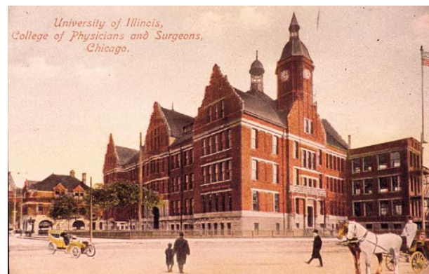
Fig 3. Old College of Physicians and Surgeons was first home for University of Illinois orthodontic department.