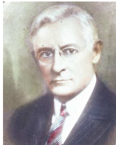
Fig 8. As 40-year editor of Dental Items of Interest , Rodrigues Ottolengui provided first forum for organized orthodontics.

Five more regional societies came into being in 1921. Others followed until there are now 8, stretching from Alaska and Hawaii to the Virgin Islands. A movement to consolidate all societies under the umbrella of the AAO, begun in the 1930s, had by 1952 come to fruition.